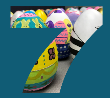
Recreation Behind the Fun & Games