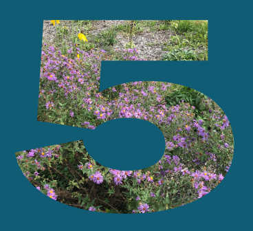
Completed Park Maintenance & Capital Improvement Projects