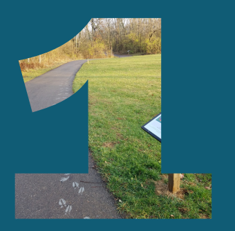
Parks & Recreation Vision, Mission, and Core Values