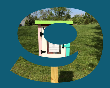
Recreation Administration, Special Projects, Master Plan Action Items